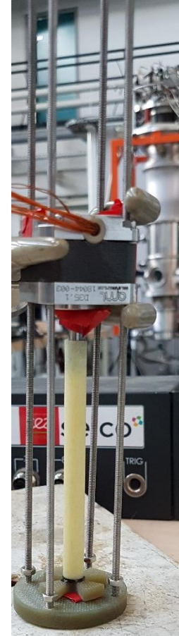
Simple heat switch prototype